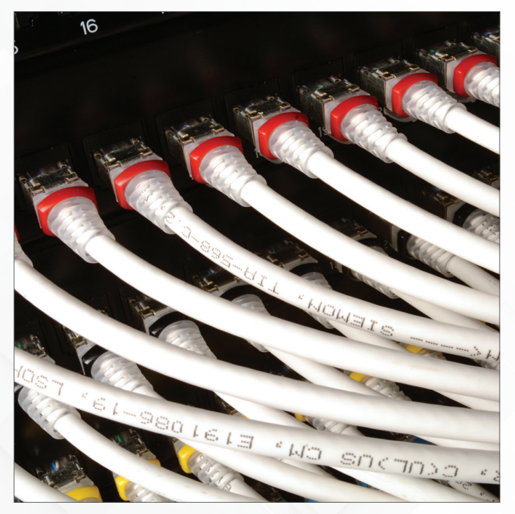
Within Wellstar's high-density copper patching areas, SkinnyPatch® Modular Cords improve manageability, airflow, and flexibility.