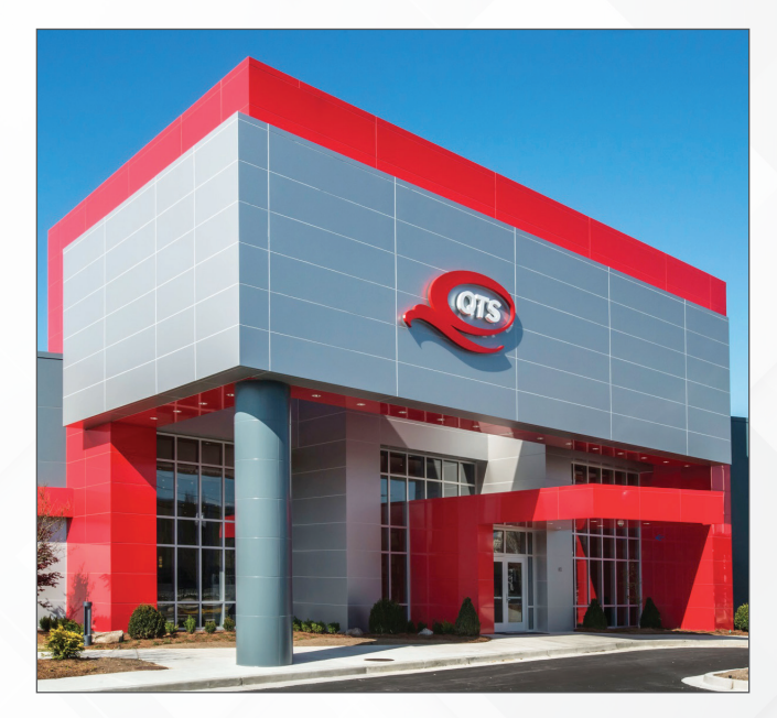
Migrating their workloads into two diverse carrier-neutral colocation data centers owned and operated by QTS, Wellstar Health System significantly enhanced security, facilitated regulatory compliance, and improved reliability.

Rather than upgrading and expanding existing data center facilities, they decided to migrate their workloads to two diverse carrier-neutral colocation data centers owned and operated by Quality Technology Services (QTS), a leading provider of more than 7 million square feet of data center space across North America and Europe. One of the colocation data centers is LEED Gold certified and the largest in the Southeast with 970,000 square feet of space, more than 275 MW of planned capacity, its own on-site power substation, and direct fiber access to a variety of service providers. The other offers 385,000 square feet and 26 MW of power capacity with diverse power feeds and plenty of room for expansion.