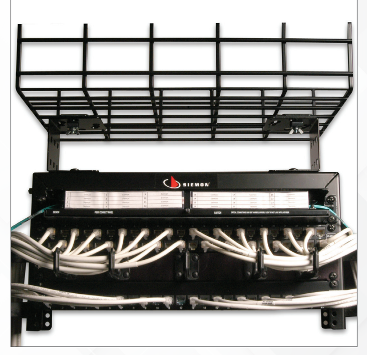
Siemon's overhead Cable Tray Rack allows Wellstar to support connectivity to data storage systems that prohibit placing components within the same cabinet.