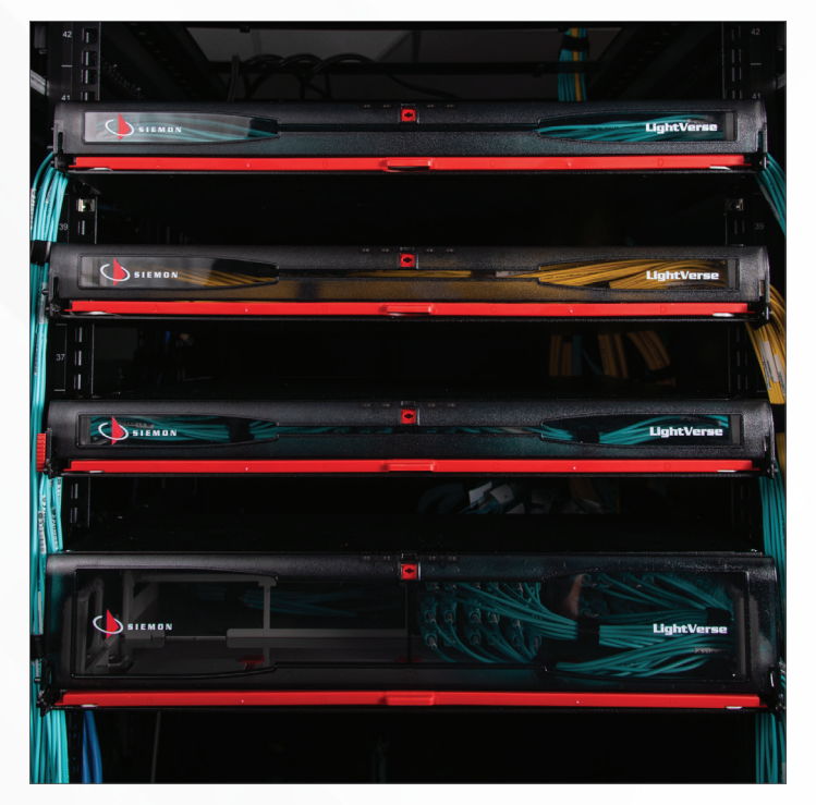
Siemon's innovative LightVerse® High-Density Fiber Optic Cabling System enabled Wellstar to expand from 72 duplex fiber ports to 96 in the same 1U space.